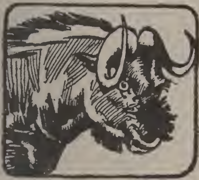
The Gnu Said He Was Bored.

“YOU know,” said daddy, “that the gnu is a very gloomy animal. I heard the other day of a gnu who had to be kept all by himself in the zoo where he belonged because of his gloomy nature and sullen ways.”